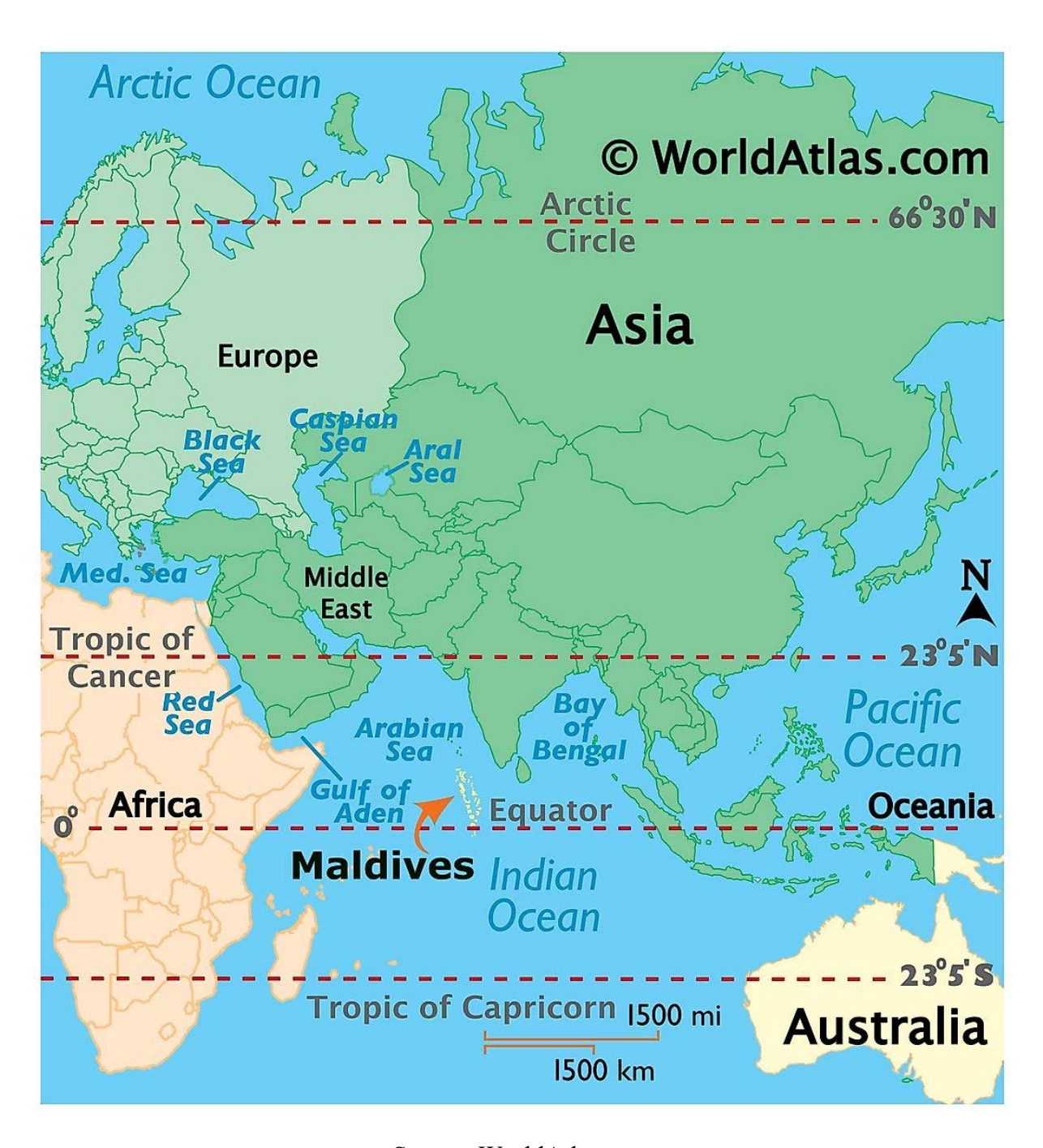
Appendix A: Map of Maldives