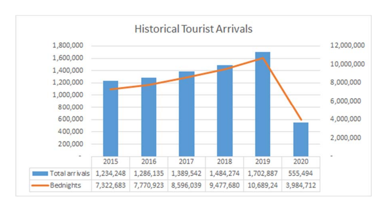
Figure 1: Historical Tourist Arrivals

Maldives is highly reliant on tourism for its foreign exchange earnings, making tourism the centre piece of the Maldivian economy. With major challenges such as climate change, lack of land-based natural and mineral resources, Maldives is still going strong on tourism sector. It is proven with the figures given from Ministry of Tourism Year Book published in 2017 that Maldives has continuously reached its goals of surpassing 1 million tourists since 2013. The following table illustrates the change in tourist arrivals and overall bed nights from 2015-2020, using data from the Maldives Monetary Authority Statistics (2021) (Figure 1)