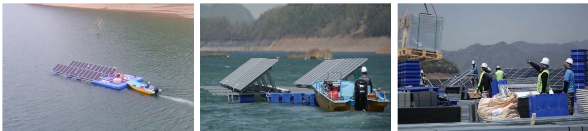
Figure 5. Local Fishermen's Participation in Ship Use and Construction

In the construction stage, by using nearby fishermen's ships during fishing breaks and participating as construction personnel, it contributed to the increase of the income of the vulnerable. It contributed to vitalization of the local economy by using local restaurants and accommodation facilities by construction workers.