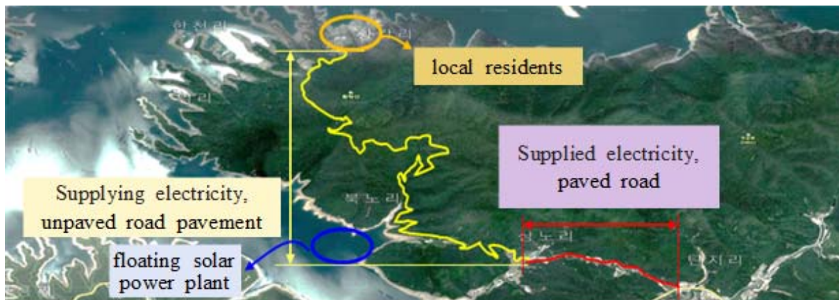
Figure 2. Supplying electricity to remote areas and improved accessibility by paving the road

Efforts should be made to minimize conflicts with stakeholders. The development of floating solar energy can be largely divided into three stages by business planning, construction and operation, and efforts to resolve conflicts through communication with stakeholders are needed at each stage.