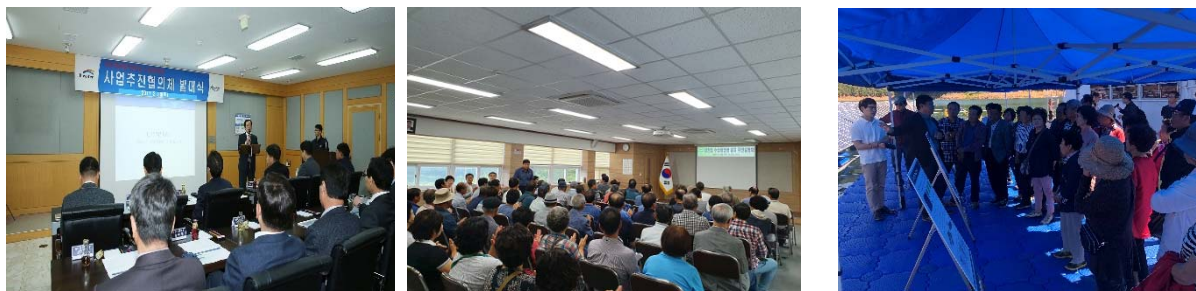
【Organization of the council】 【business briefing session】 【on-site briefing session】

In order to increase acceptance, a consultative body has been formed and operated to promote win-win development, such as attracting successful projects, preparing plans to revitalize local economies, and solving business constraints.