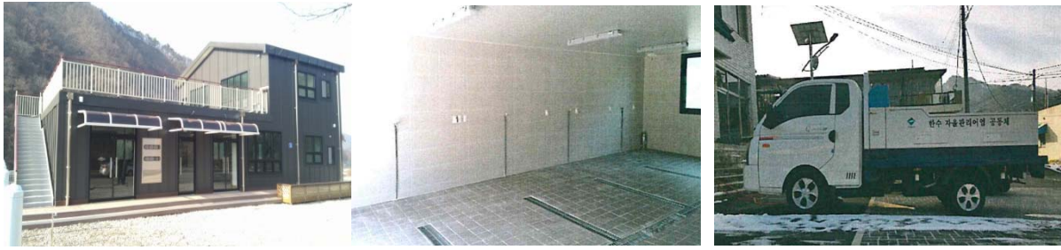
【fishery product collection center】