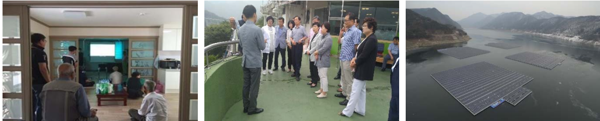
Figure 4. Resident briefing session, Field trip Boryeong Dam Floating Solar Power

field tours through resident information sessions.