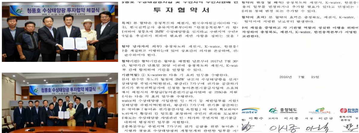
Figure 3. Investment agreement, '16.7

In addition, a business was planned through communication with stakeholders who share water surface. In order to communicate and understand the facts of floating solar power to stakeholders on the water surface of the Chungju Dam projected site for floating solar power development, efforts were made to share the operation results of existing facilities and conduct field tours through resident information sessions.