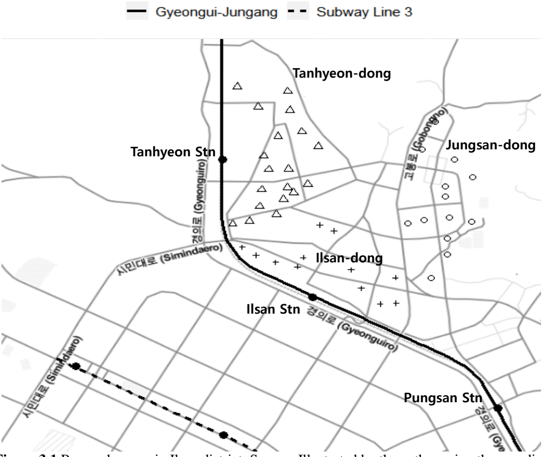
Figure 3.1 Research scope in Ilsan district. Note: Based on the study boundary, " \Delta ", "+", and "O" denote the apartment complexes in Tanhyeon, Ilsan, and Jungsan-dongs, respectively. The name of Simin-daero was changed into "Goyang-daero (Goyang Boulevard)" after 2011.

This study focuses on the apartments located in the north of Gyeongui-Jungang Line, since the areas in the south of the railroad could be affected by the subway line 3. Considering the impacts of Gyeongui-Jungang Line on housing prices could be overlapped with those of subway line 3, the apartments in the south are ruled out in this study. Based on this, this study addresses the apartments in Tanhyeon, Ilsan, and Jungsan-dongs that have many apartment complexes, as shown in Figure 3.1.<sup>2</sup>