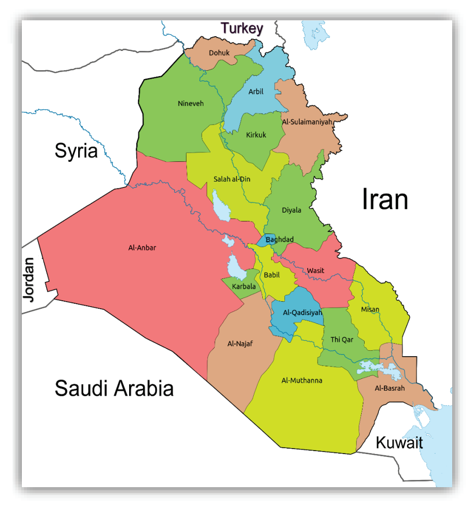
Map 1: Iraq Provinces

Arabs in Iraq comprise 75%-80% of the population, Kurds are 5%-15%, and Turkmens, Assyrians and Shabaks make up the remaining 5%. In Iraq, the majority (95%) of the population is Muslim; religious minorities (Christians, Mandaeans, Yezidis, and others) account for less than 5% of the population.