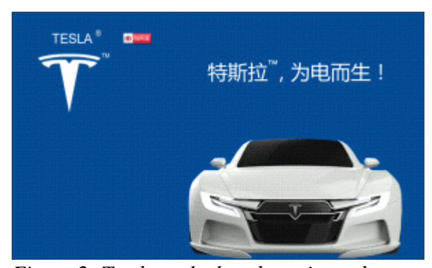
Figure 2: Trademark already registered